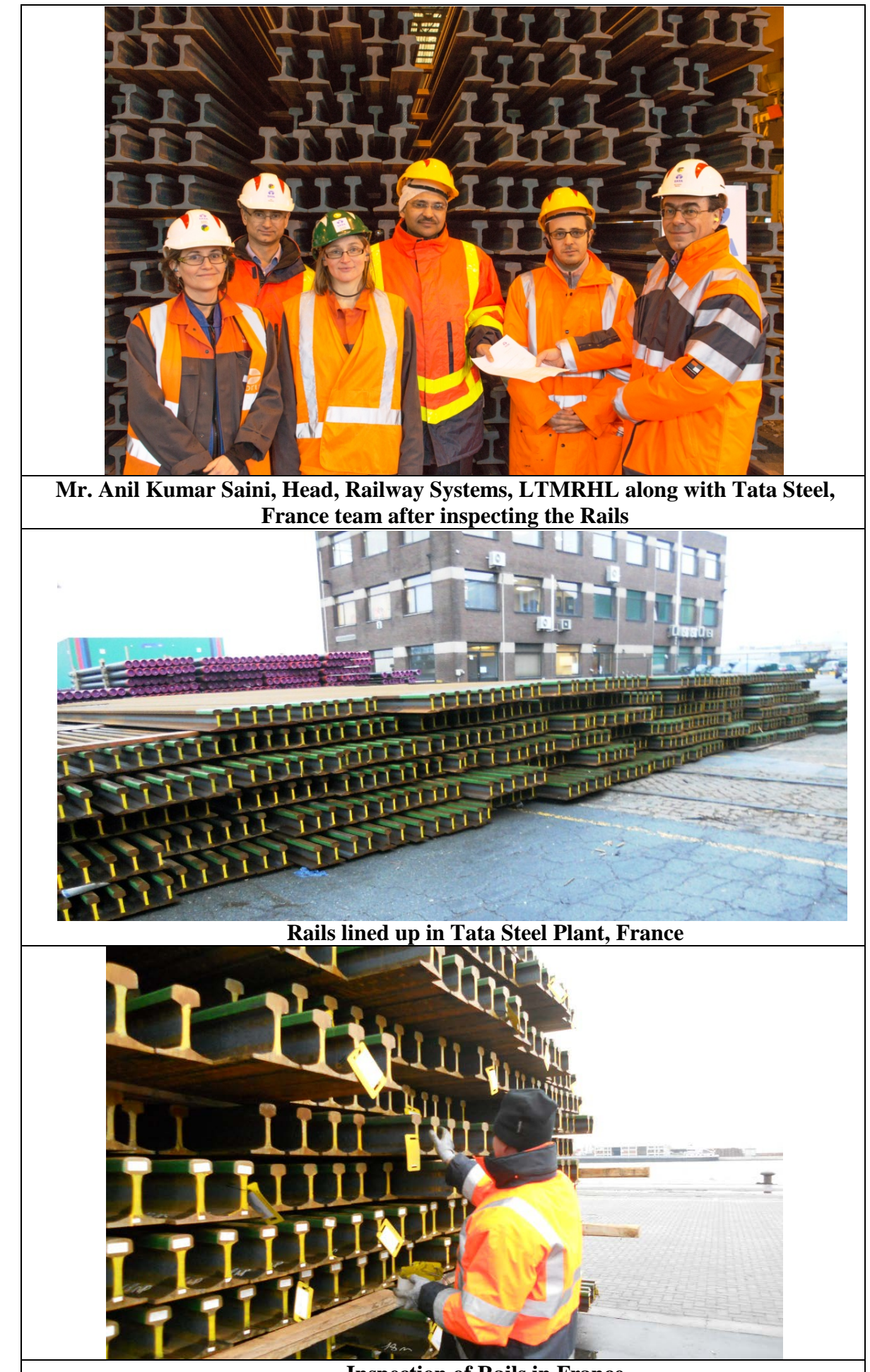
Inspection of Rails in France